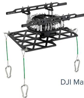
DJI Matrice 600